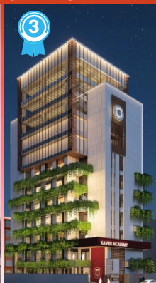
Line Work Architects JV D. Architects and Associates