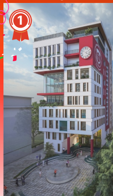
Little More Studio