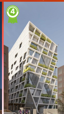
Arc Architects and Engineers